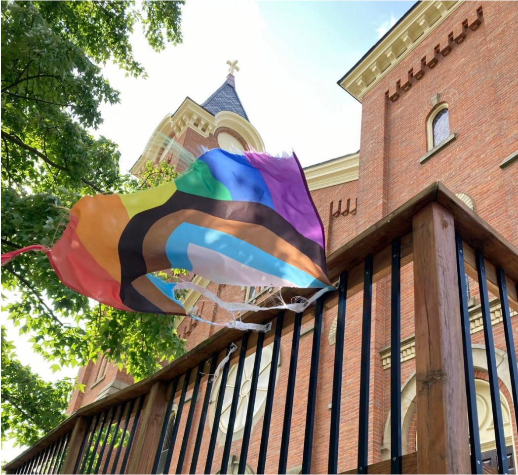
Image of shredded Progress Pride Flag from Facebook