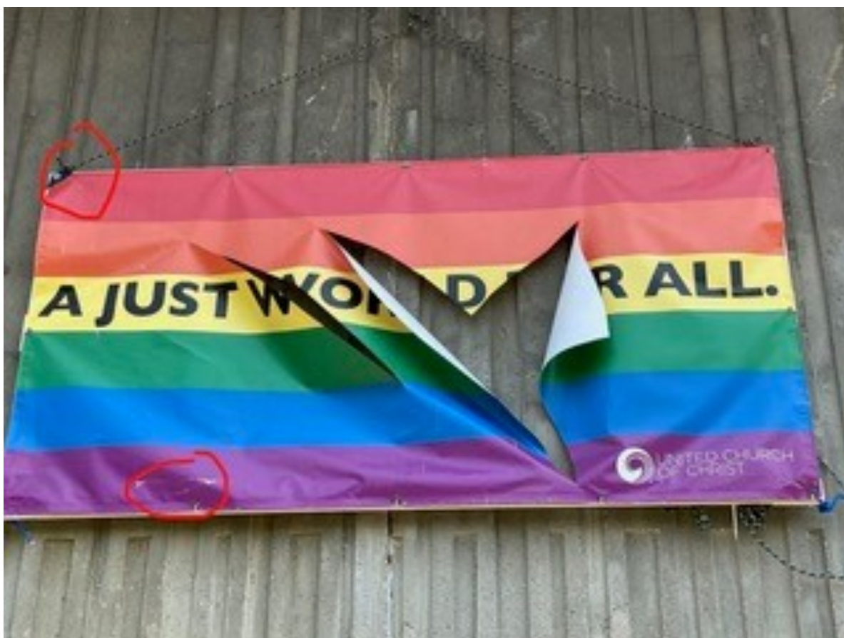
Image of vandalized A Just World For All Rainbow Flag from St Paul UCC Chelsea, MI